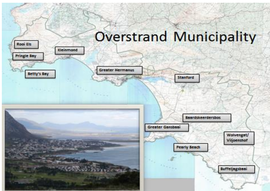
Map: Overstrand Municipality

The IDP will be applicable to the Overstrand Municipal Area which comprises a geographical area approximately 1708 km 2 , with a population of 93 466 people (2016 Community Survey) and covers the areas of Hangklip/Kleinmond, Greater Hermanus, Stanford and Greater Gansbaai. The municipal area has a coastline of approximately 230 km, stretching from Rooi Els in the west to Quinn Point in the east.