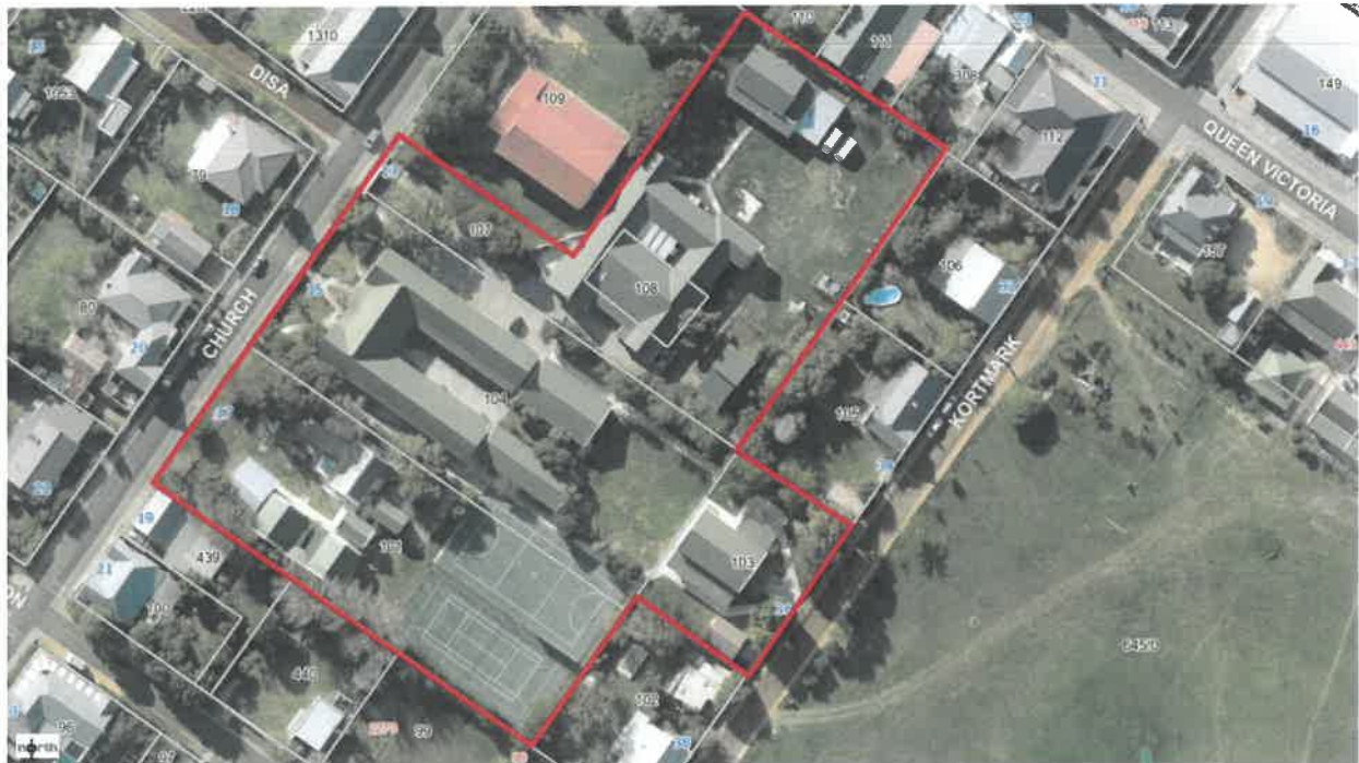
Figure 1: Extract of aerial imagery of erven comprising Okkie Smuts Primary School

The school is located along Church Street and consists of 5 properties, outlined in red on figures 1 and 2.