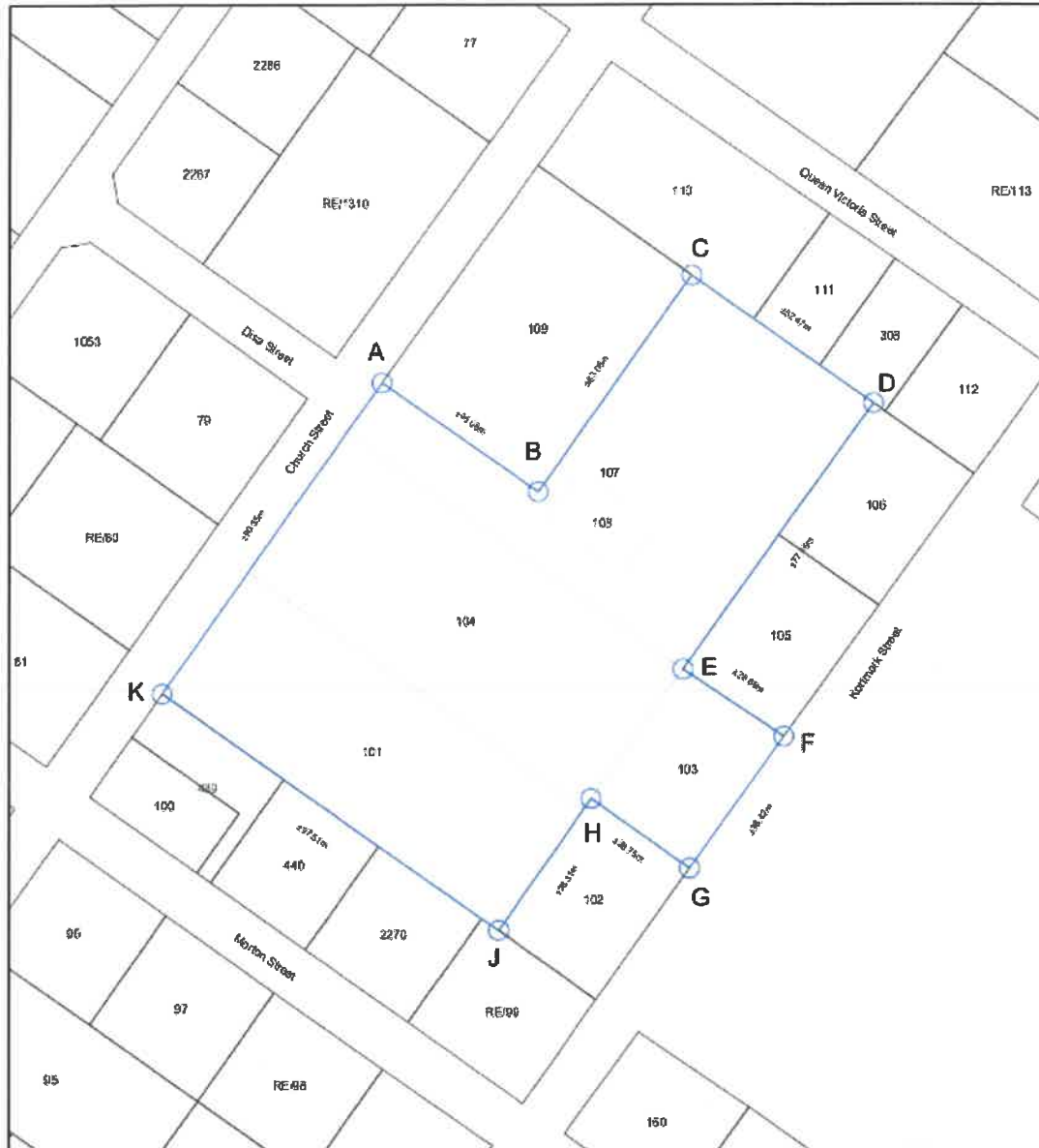
Figure 3: Extract of proposed consolidation plan

The intention of this application is to consolidate the school even into one property, as illustrated in figure 3.