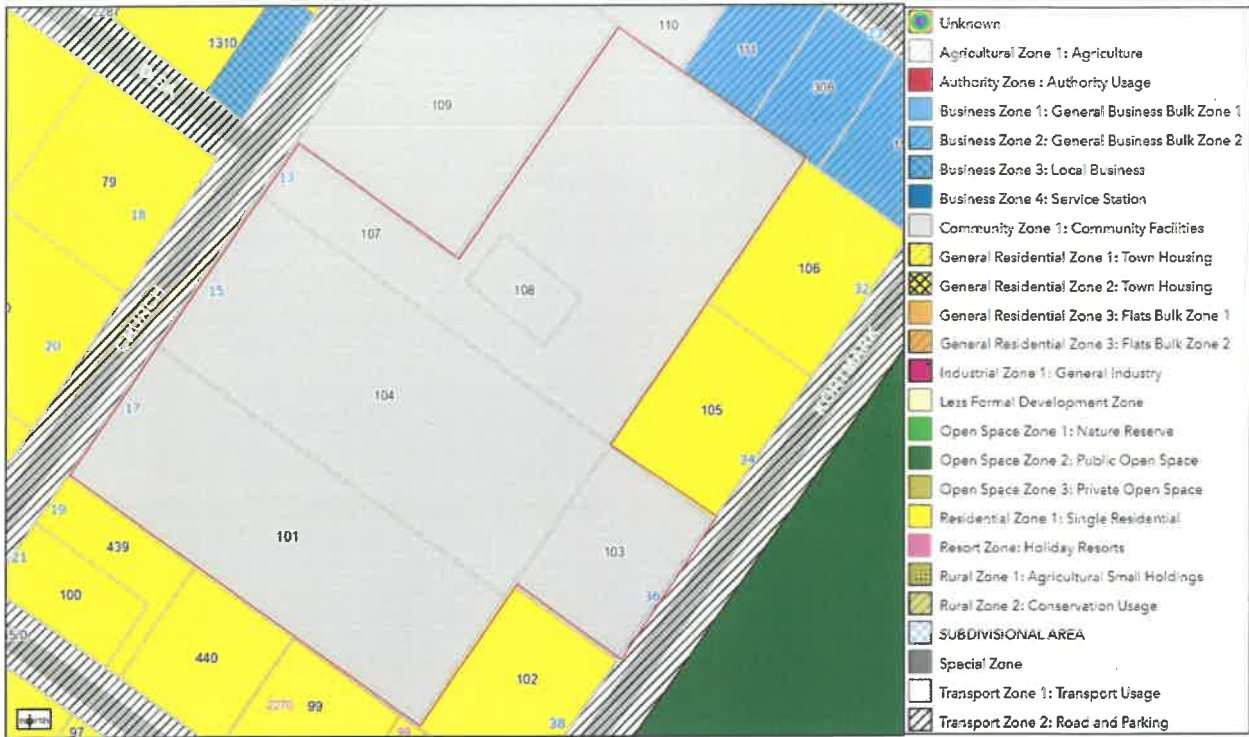
Figure 2: Extract of zoning of properties making up Okkie Smuts Primary School