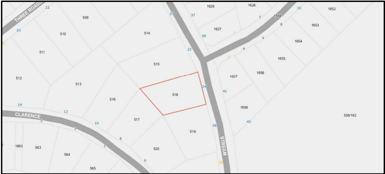
Figure 1: Locality Map of Erf 518, Pringle Bay

The subject property is situated within the Overstrand Municipality, located at 24 Stream Road, Pringle Bay. The location of the property is shown in the figure below as figure 1.