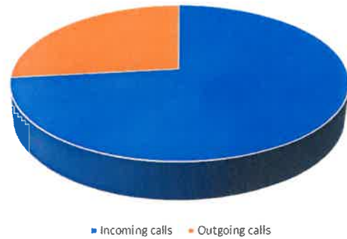
TOTAL CALLS 2400 - MARCH 2023