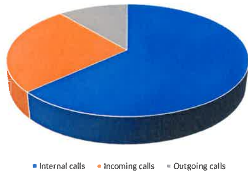
TOTAL CALLS 8980 - MARCH 2023