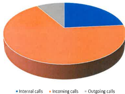
TOTAL CALLS 8996 - MARCH 2023