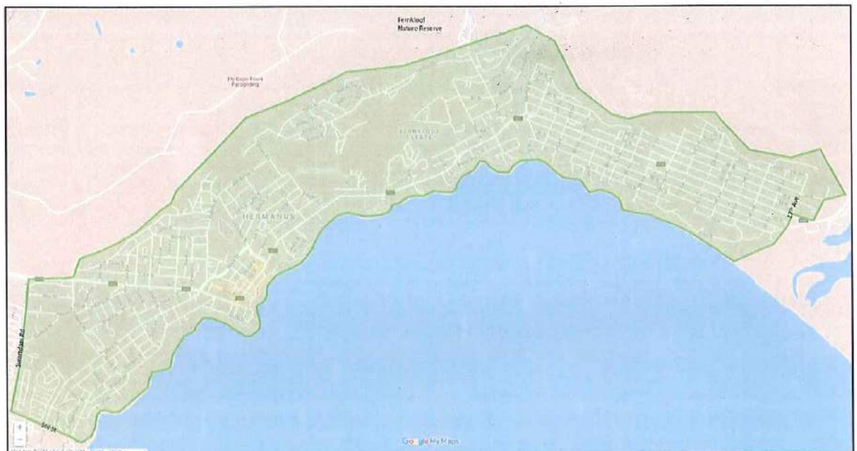
Figure 1: Proposed Area for HSRA