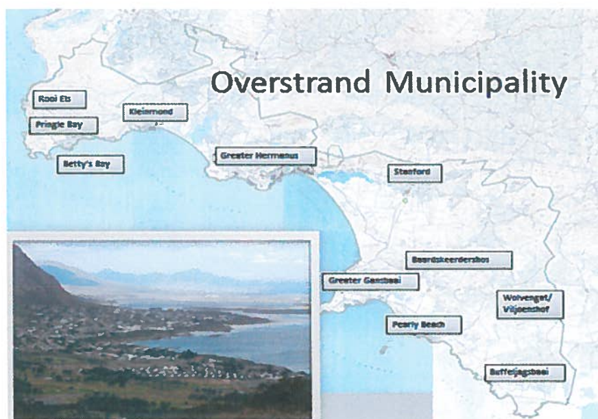
Map: Overstrand Municipality

The IDP will be applicable to the Overstrand Municipal Area which comprises a geographical area approximately 1708 km 2 , with a population of 93 466 people (2016 Community Survey) and covers the areas of Hangklip/Kleinmond, Greater Hermanus, Stanford and Greater Gansbaai. The municipal area has a coastline of approximately 230 km, stretching from Rooi Els in the west to Quinn Point in the east.