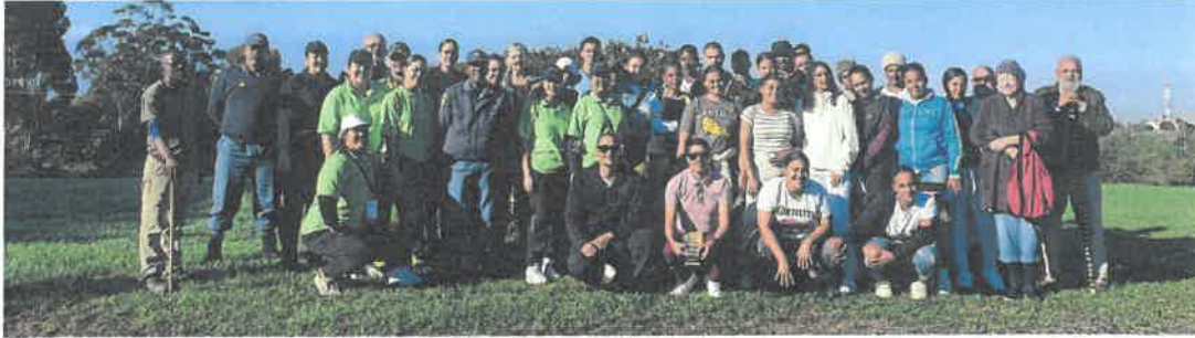
Deelnemers aan die Vryheidsdag-staptog in die Caledon-veldblommetuin.